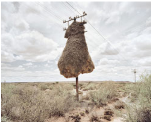
This electric pole had become a giant communal nest home to small birds called social weavers, their construction defies gravity law

Yes, you are right, there is a sense of the resilience of nature in most of my work. Nature will ultimately find a way to adapt to the exploitations of humans. It may not be as rich and diverse as a result, but it will survive.