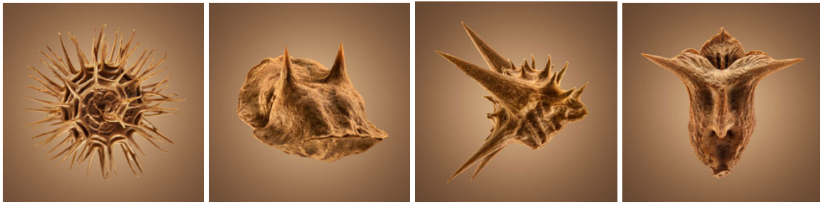
Plants seeds growing in inhospitable conditions must be gifted with the best fitted shapes enabling them to travel firmly clutched to moving hosts, thus playing hidden hitch hikers towards more welcoming breeding grounds

Your last words for the young generations would be ... ?