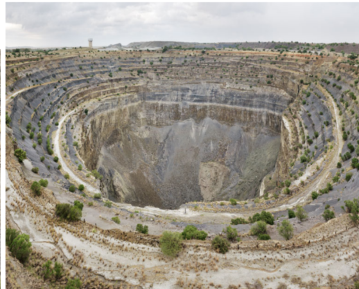
Dillon Marsh shapes into geometric figures the global warming consequences and the industry mining's havoc, acknowledging the ecological crisis in the process

On one hand, across the world the mining industry is allegedly assumed by the average population and governments to be essential to both the local and global economy. On the other hand, during operation and long after shutdown, mines exploitation causes significant damage to the environment and raises major concerns such as water contamination, wildlife habitat destruction, health poisoning and human rights abuse. Hypothetical economic spinoff thus comes at a high cost ... the very same cost you question in your photographs.